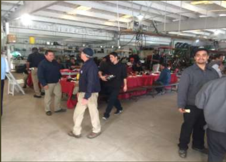
Taco Man at Christmas