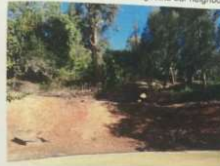
#18 neighbor; Fallen tree at #9 right, along fence.

Good fences make good neighbors. There remains areas of the property without perimeter fencing. This, in turn, exacerbates trespassing issues. The fencing between the golf course and neighbors at #9, 16, and 18 are unattractive and in a state of disrepair. We wish to open a dialogue with each neighbor to replace the fences with a black cyclone fence. While the Green Committee supports these fencing suggestions, we will attempt to negotiate our neighbors' contributions.