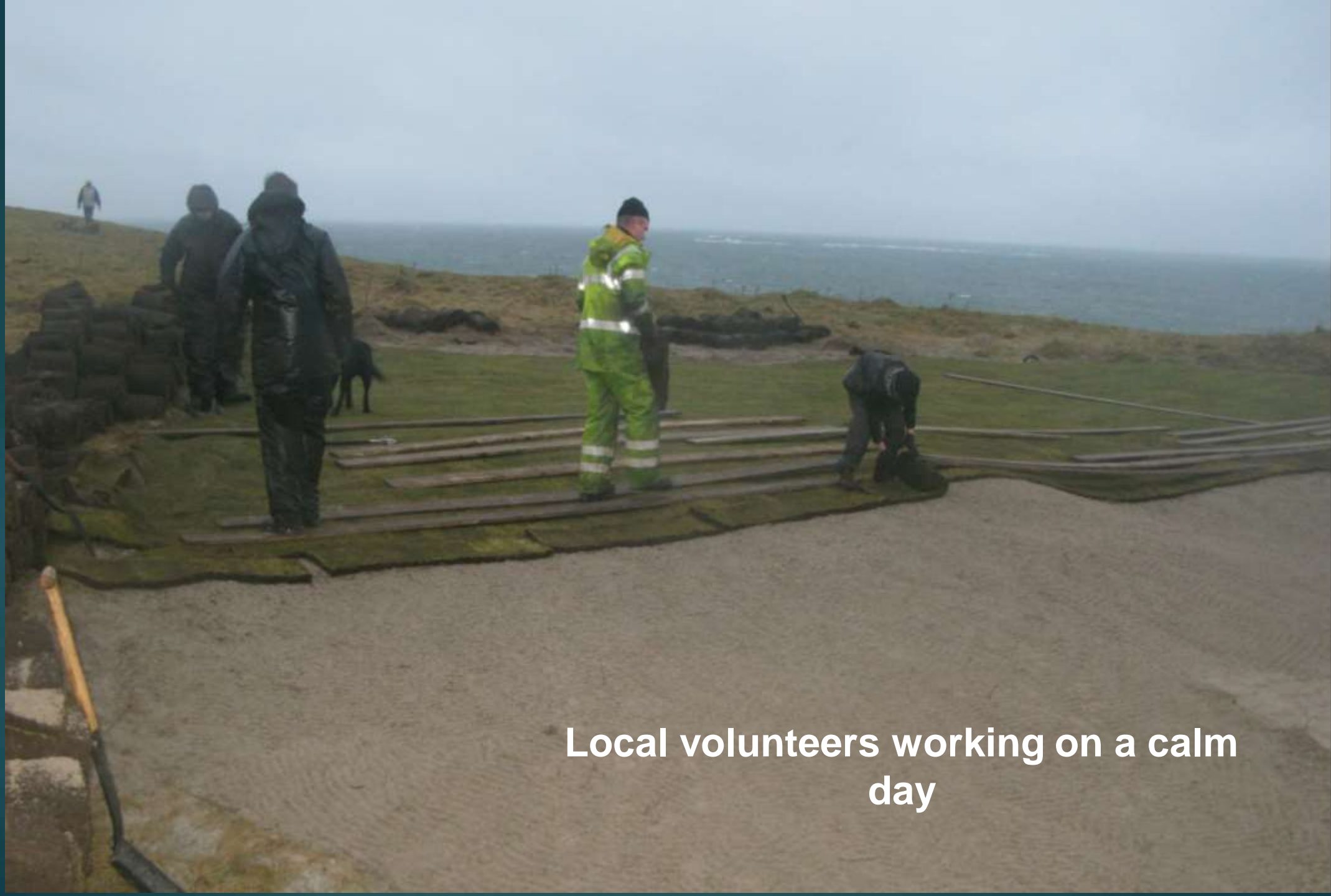
Local volunteers working on a calm day